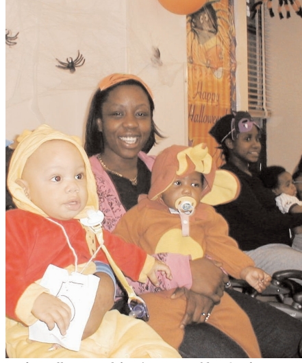
The Halloween celebration at Brooklyn Gardens included a costume contest, lots of great food and an elaborate haunted house. The kids (and adults!) had a