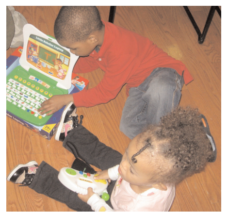
The children of Arbor Inn enjoy playing with the fun and educational toys from Santa. (above) Santa runs the risk of having a lollipop in his beard! (right)