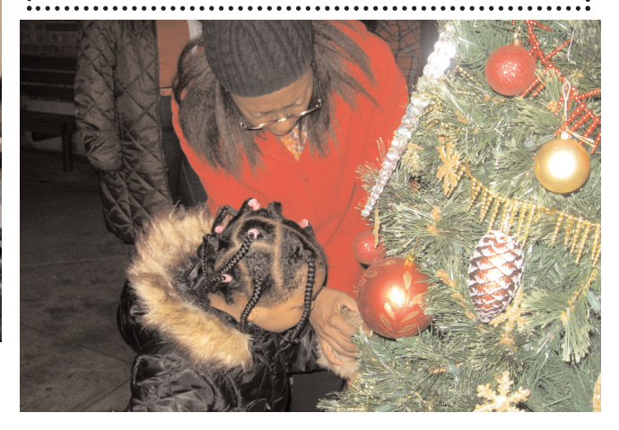
Residents gathered for fun, food, and laughter at the Thanksgiving meal held for the Apartment Program. (above) At the tree trimming party at Brooklyn Gardens, finishing touches are put on the beautiful