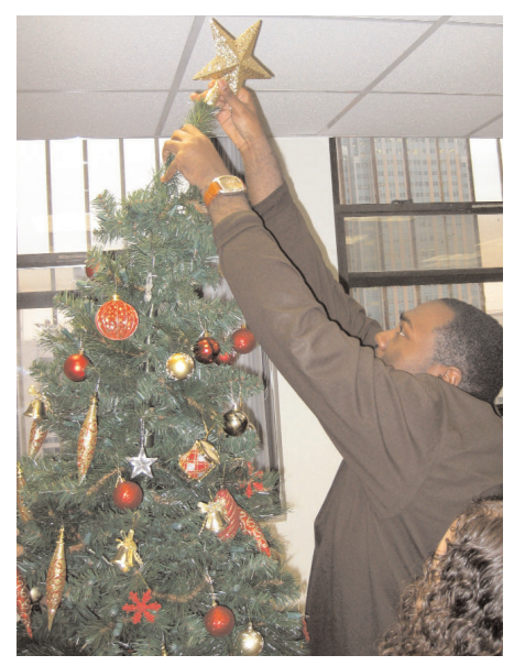
One of the taller residents had the pleasure of top ping the tree off with a star at the tree trimming party held for the Apartment Program.