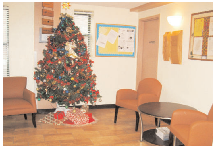
Oak Hall Lobby After