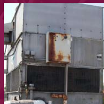
Below: The 19-year-old cooling tower that was replaced in May, 2010.