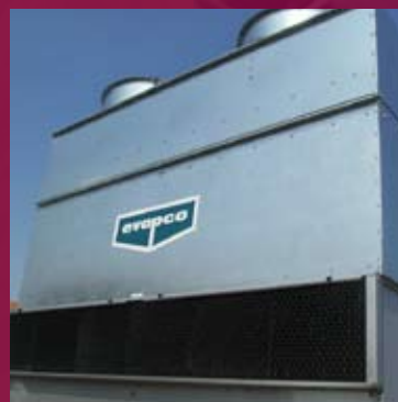
Left: The new cooling tower at Brooklyn Gardens .