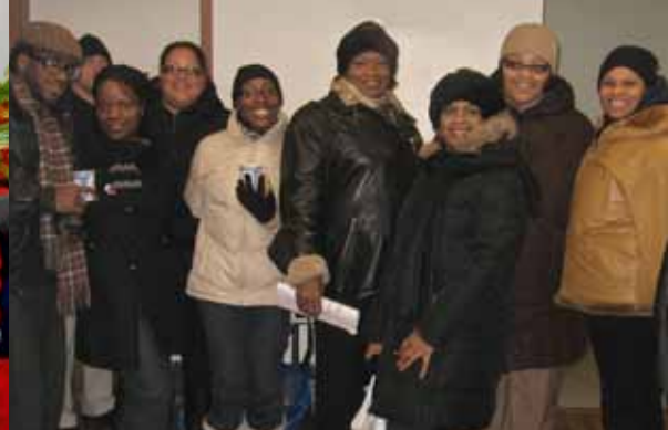
Above Left: Volunteers from the Living God Ministries