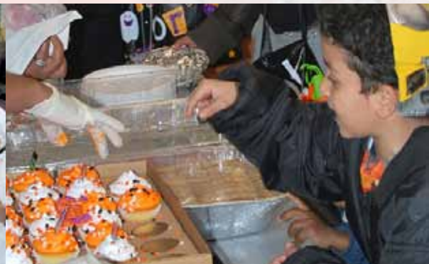
Above: Kids, costumes and cupcakes at the Arbor Inn Halloween party