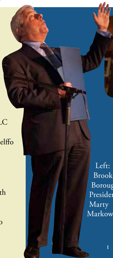
Left: Brooklyn Borough President Marty Markowitz